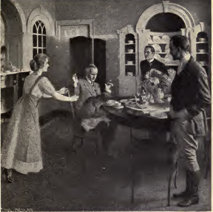
Jane-Ellen sprang forward and snatched the cat from Tucker's knee